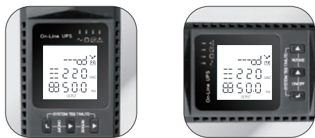
Two directions LCD display