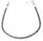
Short fast connector